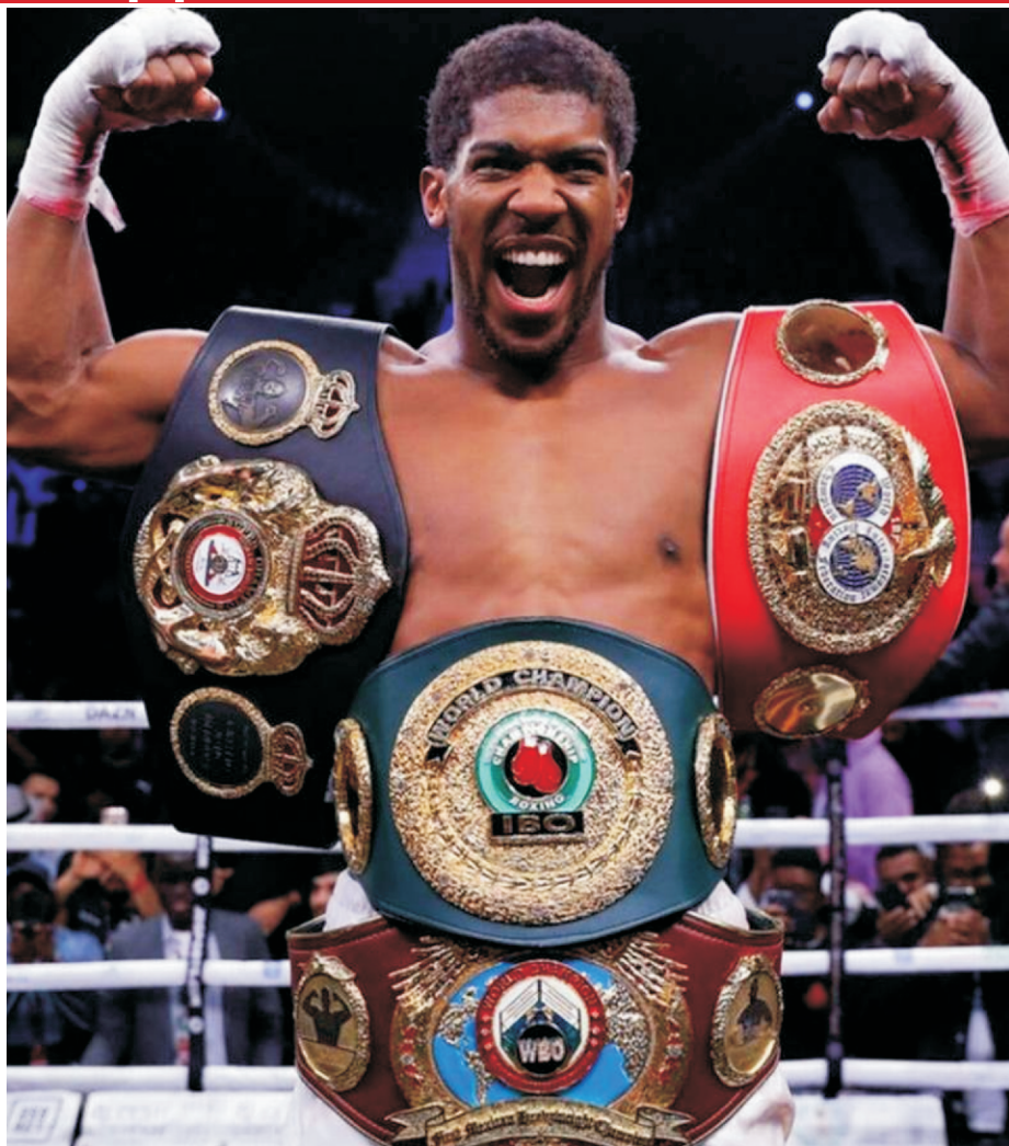
Anthony Olasheni Joshua

The explosive showdown between Anthony Joshua and Deontay Wilder will not happen until 2022, boxing promoter Eddie Hearn said. Joshua's attempt to agree a deal with Wilder has been frustrated over the years until Tyson Fury snatched the WBC belt from Wilder by knocking him out in a brutal way. Joshua, who is currently the holder of the WBO, IBF and WBA boxing belts, is holding talks with Tyson Fury over a 2-match fight which will unify the belts in the heavyweight division. "Deontay Wilder knows he turned down the deal of a lifetime to fight Anthony Joshua but he made his bed and respects him. I want to see him back in the ring. "All we're focusing on is the Tyson Fury fight, and anything else happens in 2022, because those two fights will be our plan for 2021," Hearn said.