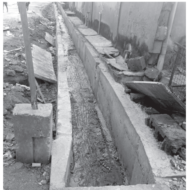
Ongoing David Ogunti road construction drainage

The councillors, therefore, appreciated Governor Sanwo-Olu for reaching out to help the community through the councillors across Lagos State while encouraging residents to sustain the projects and avoid disposing refuse in the drains to avoid flood.