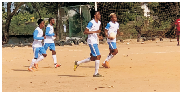
FC Brave celebrating

in the first half as they fired blank at their home ground. Chances came the way of Rechabites FC in the second half but most were wasted as they cut a frustrated figure over lack of goals. FC Brave held their ground and were able to curtail the attacking threat of their opponent in a very tough game. The second half did not record any goal as both teams fired agonisingly wide off the goal